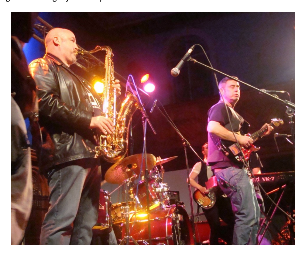
Midnight Jam and Guests