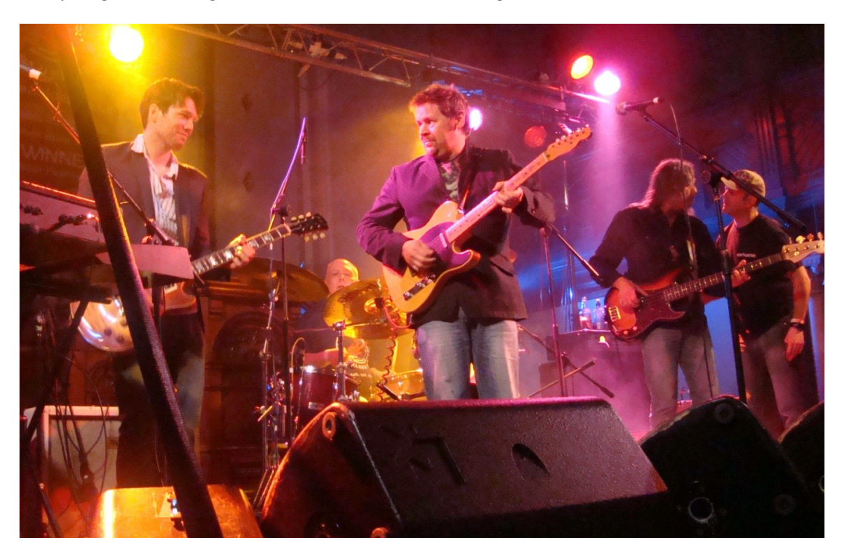
Guests from the evening join the jam