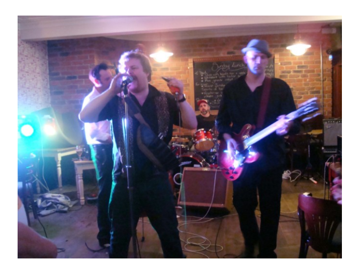
Junkhouse Dog Blues Band