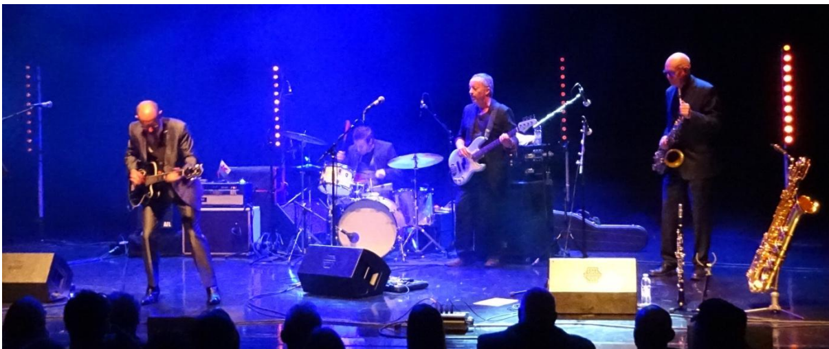
Andy Fairweather Low and The Low Riders

The headline act for the evening were the long serving Andy Fairweather Low and The Low Riders. On the Theatre Stage for this set, it was a trip down memory lane with many of the songs that Andy had been involved with for the past 50 years being performed, ranging from rock 'n roll, blues to pop classics. With the seasoned musicianship and experience of the band, it was always going to be a crowd pleaser. http://andyfairweatherlow.com/