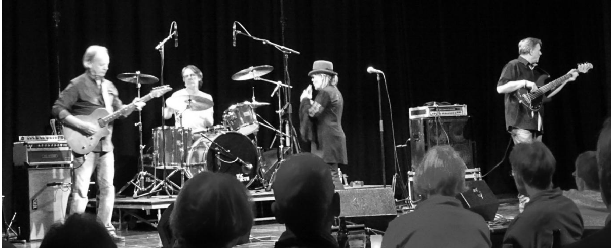
Connie Lush Band