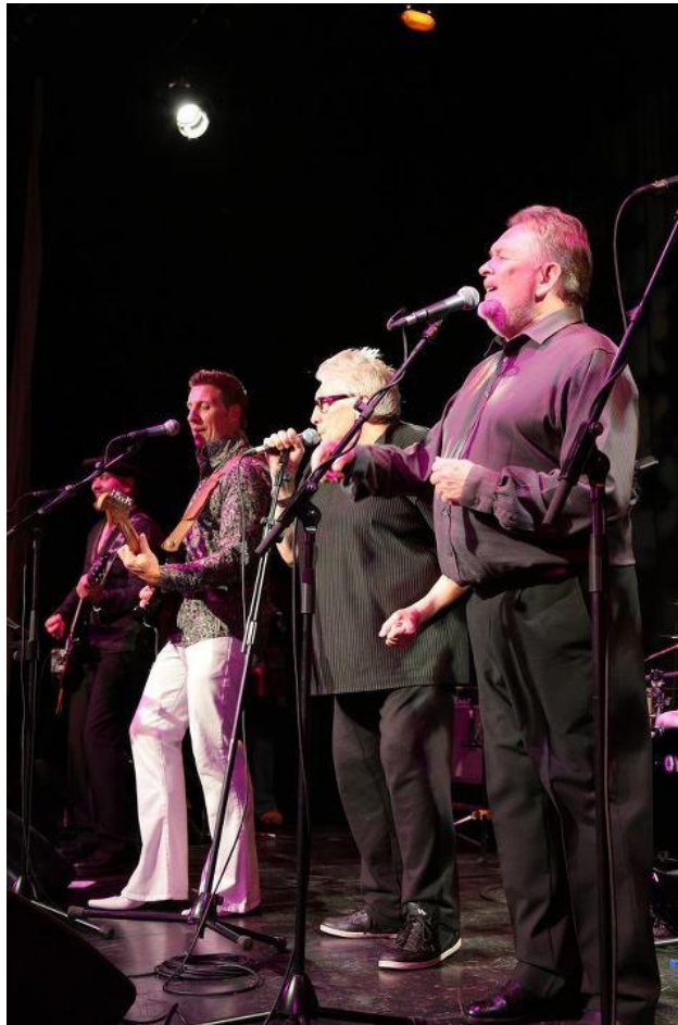
Chris Farlowe, Cliff Bennett and the New Amen Corner

The final acts on the main stage were Chris Farlowe , Cliff Bennett and the New Amen Corner . A great set and enjoyed by all, Chris can still belt out the music and was well supported by the band, A memorable evening.