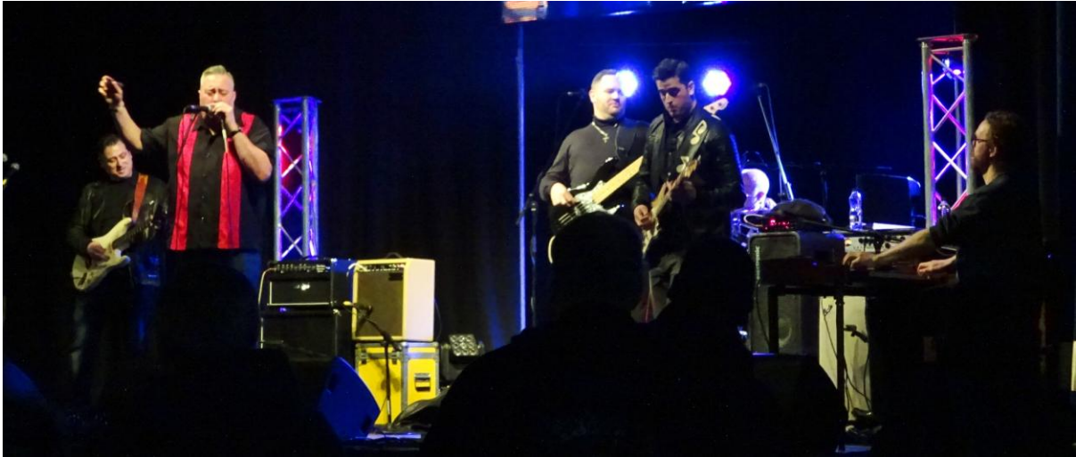
Backwater Roll www.facebook.com/Backwater-Roll-Blues-Band

A solid six piece blues band in the form of Backwater Roll next. Harmonica infused with a Chicago influence they gave a great classic blues performance.