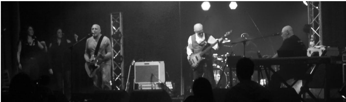
Lol Goodman Band http://www.lolgoodmanband.com/

The Lol Goodman Band as a six piece band were next up on the Introducing Stage. From Manchester, they played classic electric blues with a good all round big sound.