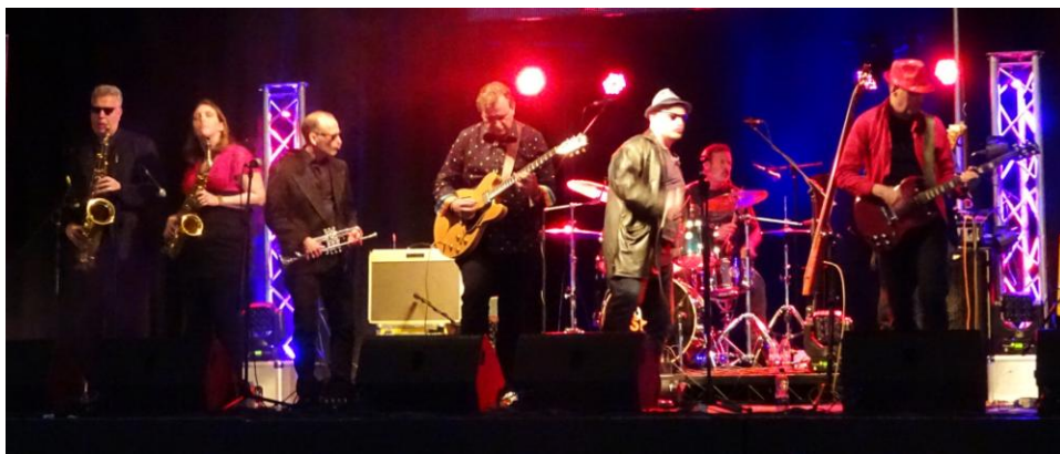
Bourbon Street Revival http://www.bourbonstreetrevival.com/

The final band tonight on the Introducing Stage was a big band outfit, Bourbon Street Revival . An eight piece with a full on brass section.