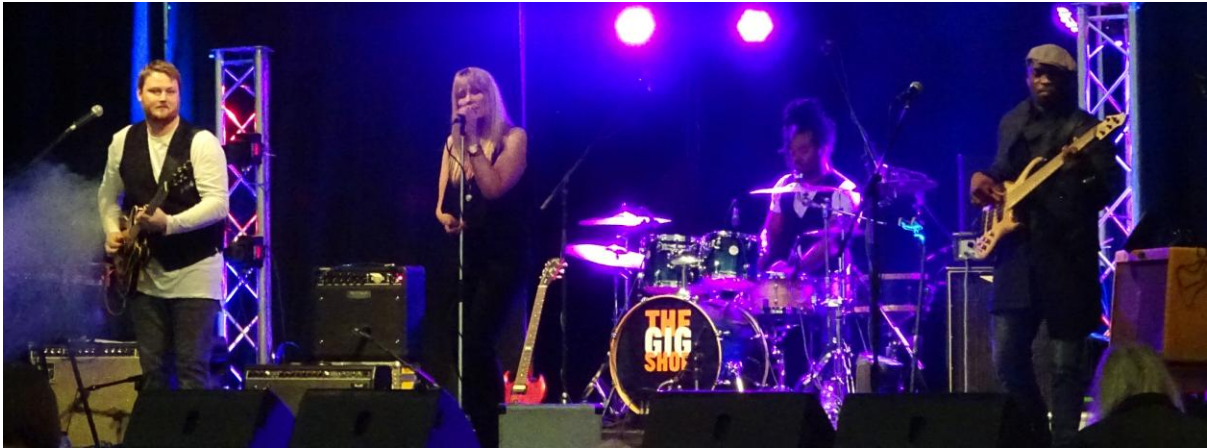
Zoe Green Band https://www.facebook.com/zoegreenband/

The Lol Goodman Band as a six piece band were next up on the Introducing Stage. From Manchester, they played classic electric blues with a good all round big sound.