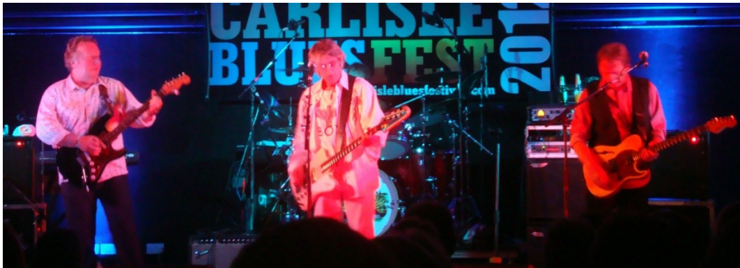
Martin Turner's Wishbone Ash