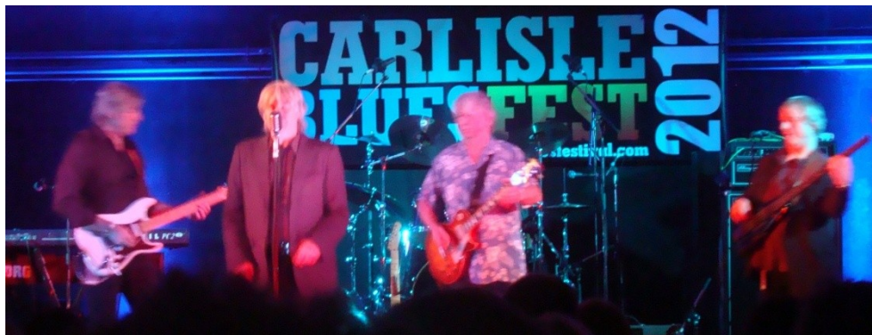
Mick Ralphs Blues Band

The next band to hit the stage were Martin Turner's Wishbone Ash . I'm not sure where they fitted into a blues festival....but I suppose variety is the spice of life! Never one of my favourites first time around, they played some standard, old, prog rock numbers. Martin Turner, as the bass player seemed a little out of place, but the rest of the band were extremely competent musicians.